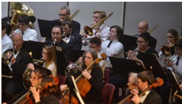
QAYO side-by-side performance with the Quincy Symphony Orchestra.

Once accepted into the QAYO, each student must meet standards of attendance, preparation, and behavior. Absences must be excused in advance, except in cases of emergency or sudden illness.