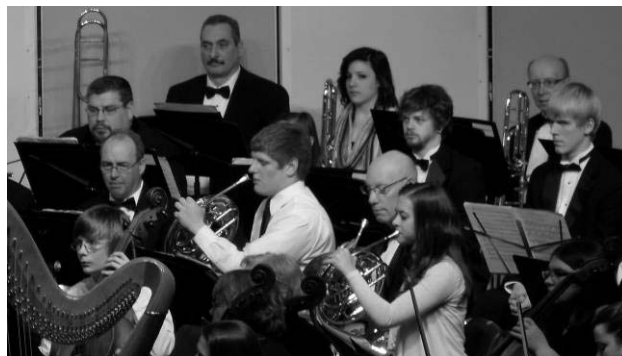
QAYO side-by-side performance with the Quincy Symphony Orchestra.

Once accepted into the QAYO, each student must meet standards of attendance, preparation, and behavior. Absences must be excused in advance, except in cases of emergency or sudden illness.